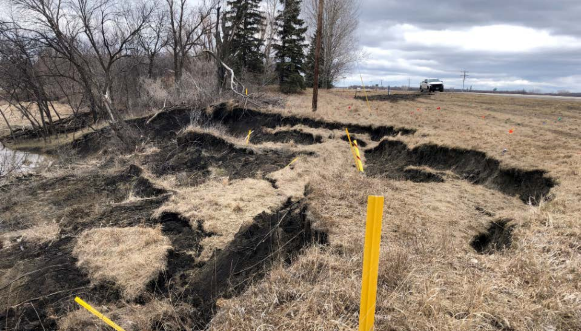
Cass Hwy 81 –Slide Repair – Wild Rice River