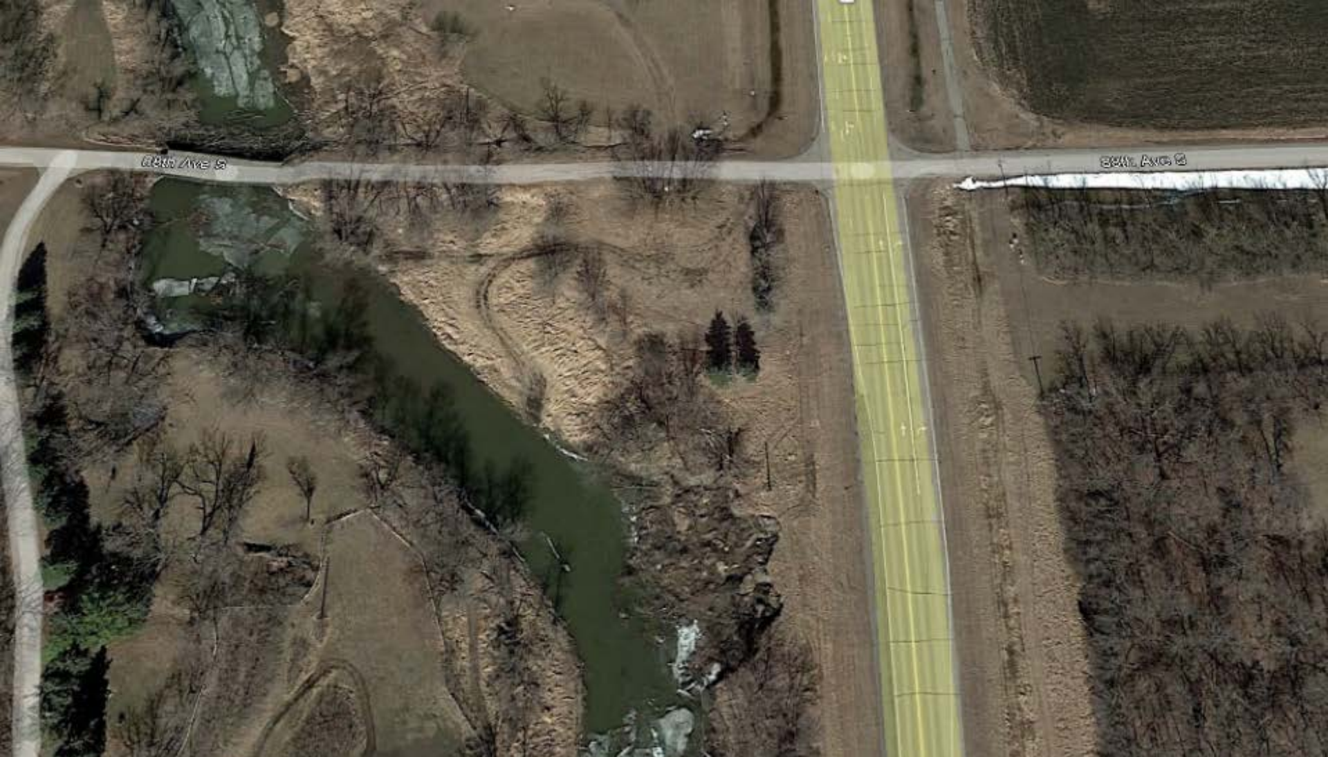
Cass Hwy 81 –Slide Repair – Wild Rice River