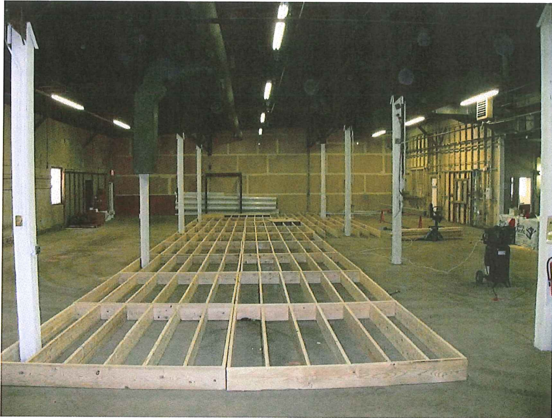
Base for the Maple River Aqueduct physical model