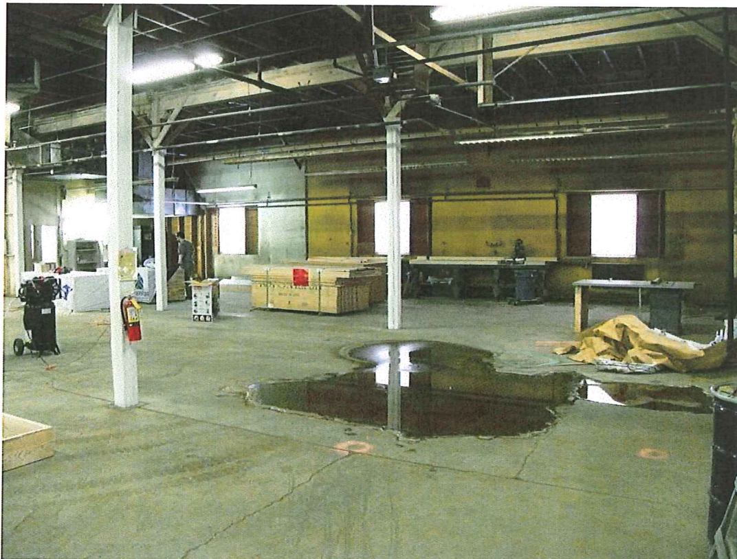
Space for constructing the Maple River Aqueduct physical