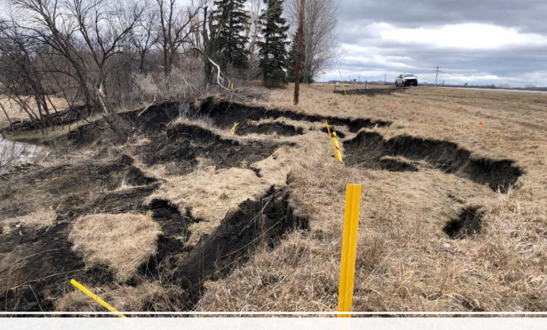
Cass Hwy 81 -Slide Repair - Wild Rice River