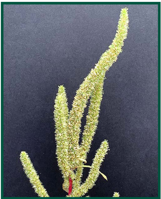
Figure 3. Palmer amaranth seed head