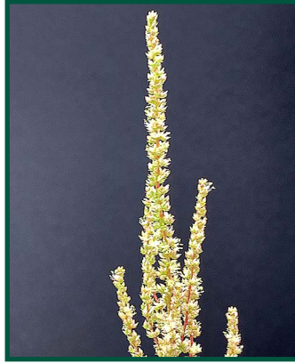
Figure 6. Waterhemp seed head