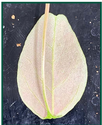
Figure 4. Palmer amaranth petiole