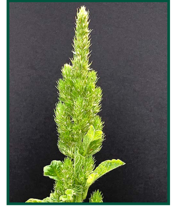
Figure 14. Powell amaranth seed head