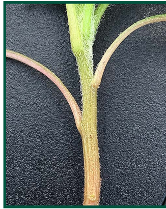
Figure 9. Redroot pigweed stem