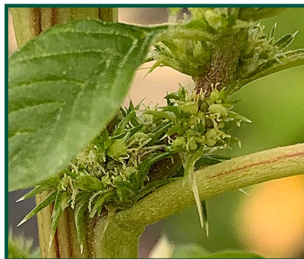
Figure 15. Palmer amaranth spiny bracts