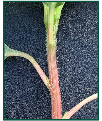
Figure 12. Powell amaranth stem