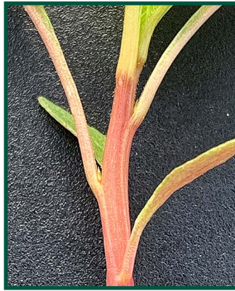
Figure 5. Waterhemp stem