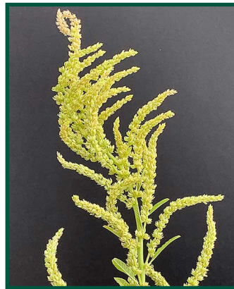
Figure 7. Waterhemp seed head