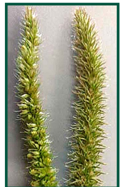
Figure 16. Palmer amaranth seed head