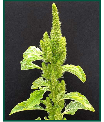
Figure 13. Powell amaranth seed head