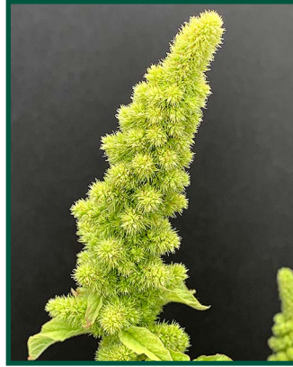
Figure 10. Redroot pigweed seed head