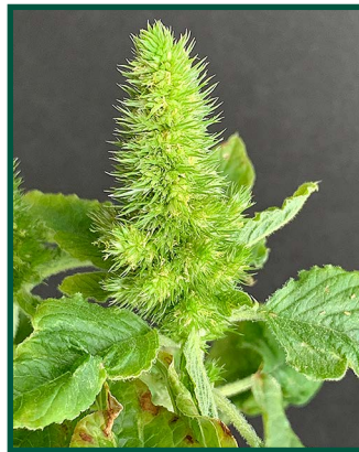
Figure 11. Redroot pigweed seed head