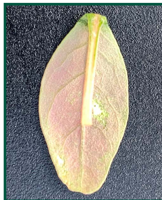
Figure 8. Waterhemp petiole