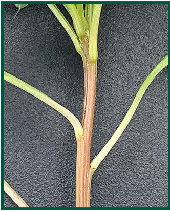
Figure 1. Palmer amaranth stem