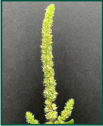
Figure 2. Palmer amaranth seed head